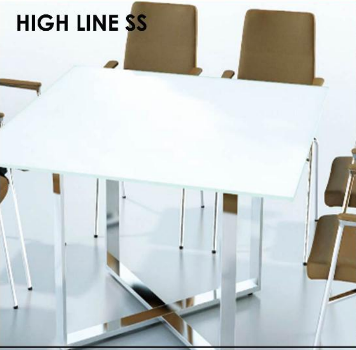
HIGH LINE SS