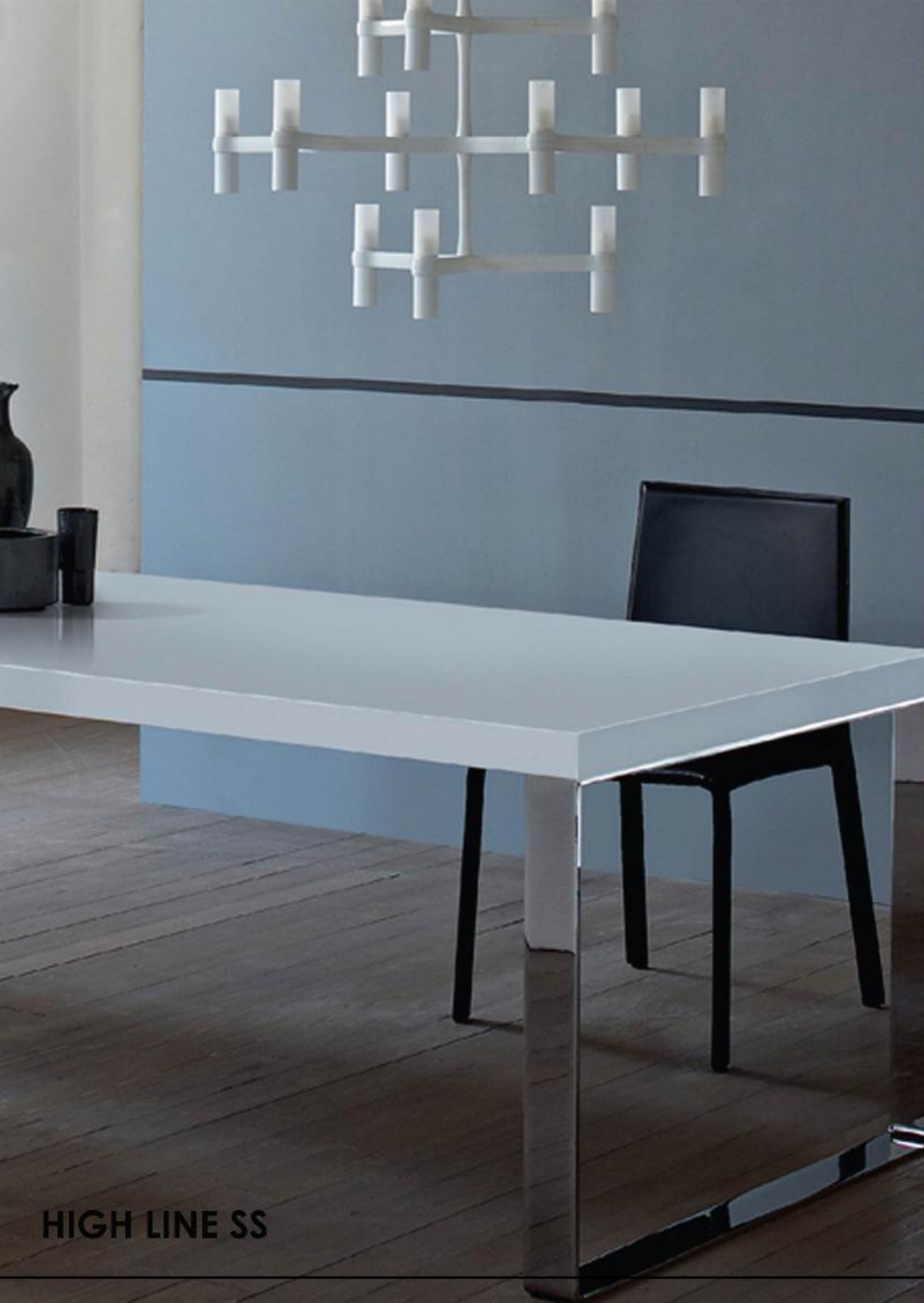
HIGH LINE SS