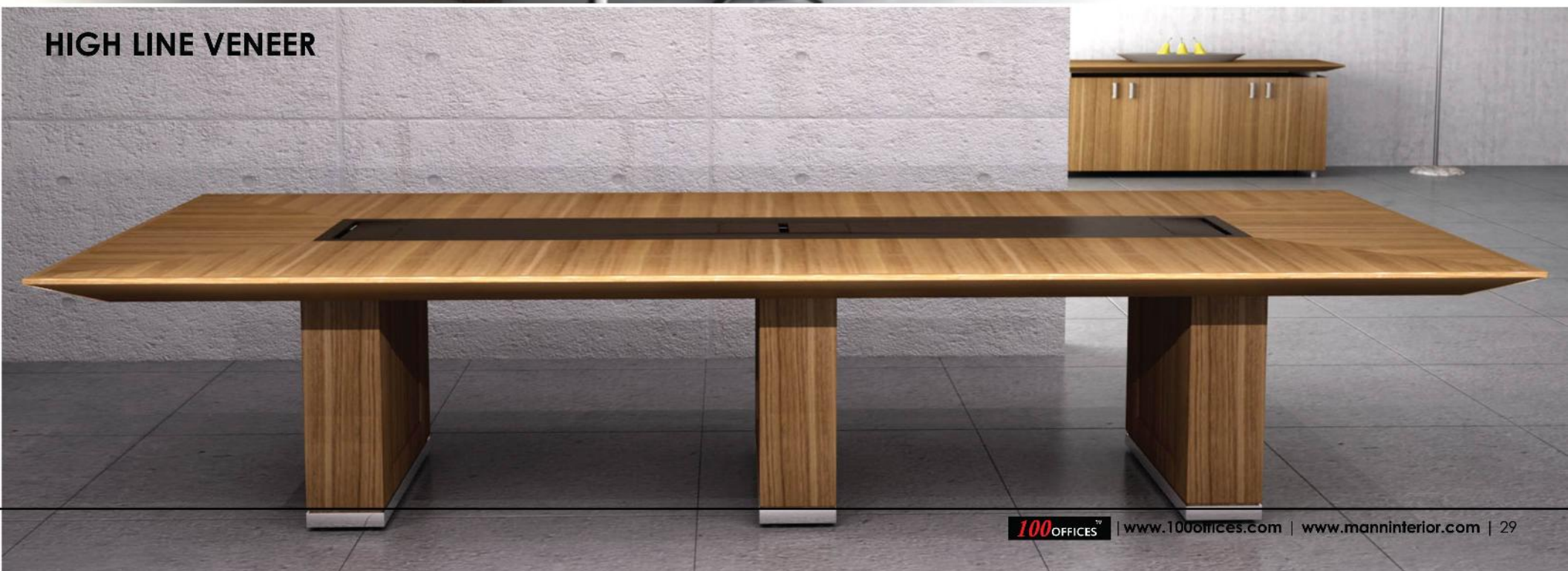
HIGH LINE VENEER