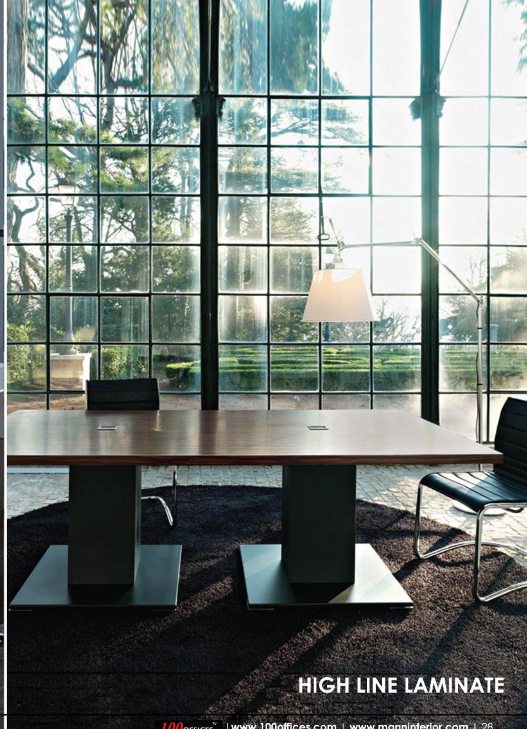
HIGH LINE LAMINATE