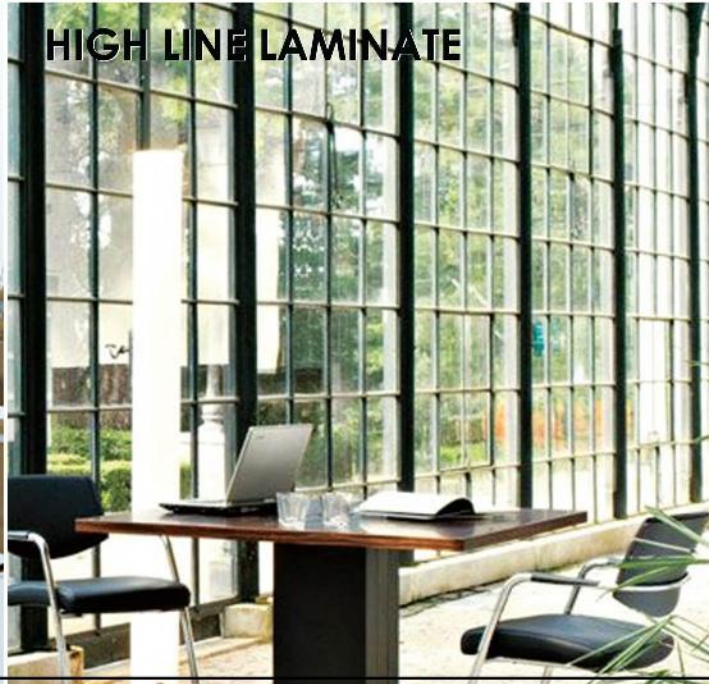
HIGH LINE LAMINATE