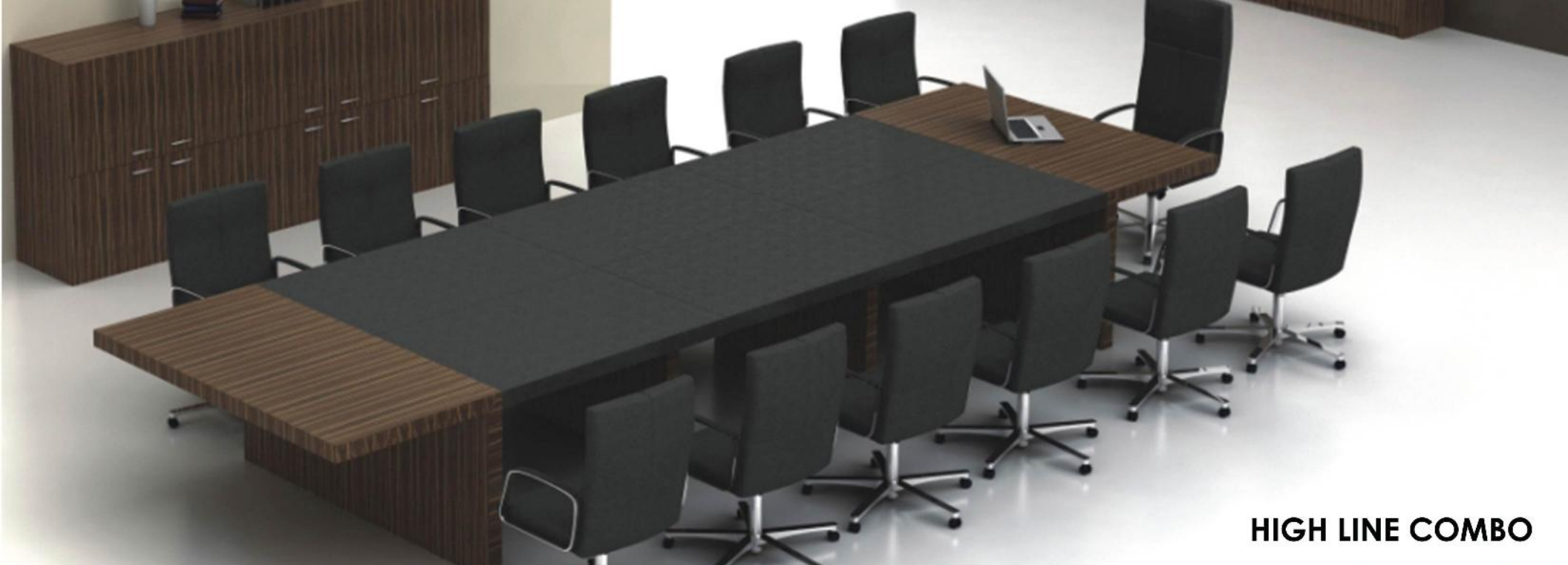
HIGH LINE COMBO